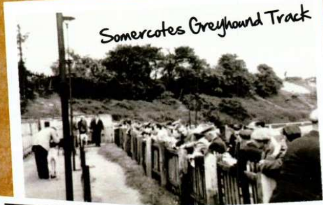
Somercotes Greyhound Track

Light refreshments are available on the day at a reasonable charge.