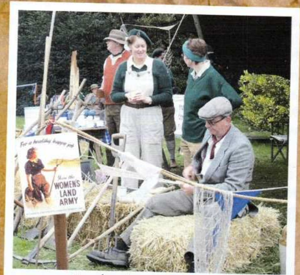
Papplewick pumping station WW2 event Oct 2013