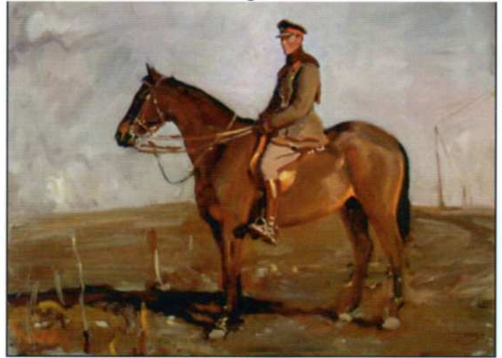
General J. E. B. Seely on Warrior painted by Sir Alfred Munnings January 1918

WARRIOR died at Easter 1941 and had the distinction of being the only animal ever to have an obituary in the Times newspaper.