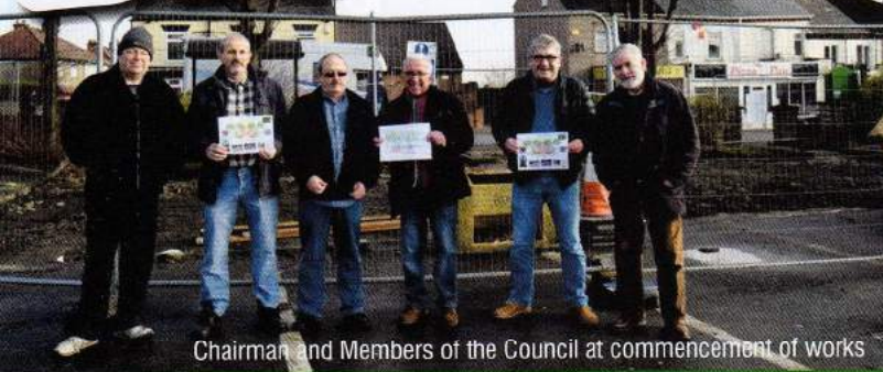
Chairman and Members of the Council at commencement of works

31st January 2017 was the day that Groundwork (Crestra Ltd) commenced excavating the Feature Garden site, adjacent to the Village Hall, Market Place Car Park.