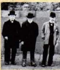
Members of the Oakes family