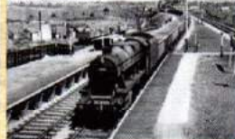
Railway Coal Train