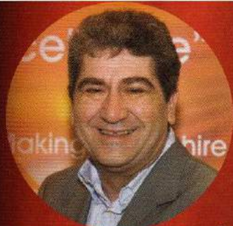
Letter from your Country Councillor Dear Resident