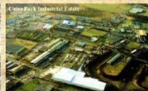
Coal-Park Industrial Estate