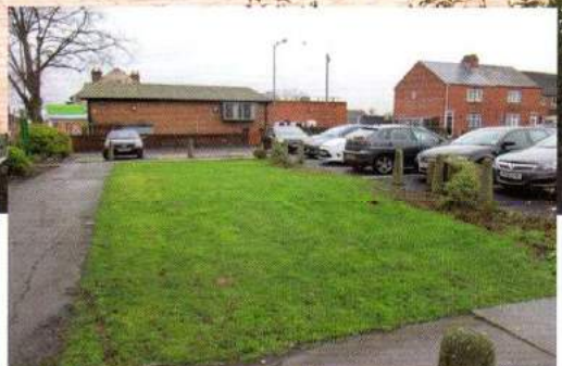
Pictured top the new garden is almost finished.

The Council would like to thank Tesco Bags of Help; Groundwork Creswell Ashfield & Mansfield; Crestra Ltd; MG Building Services; M Kemp Electrical Testing Services, Ripley and Somercotes Local History Society for their assistance and contributions. Acanthus Stone, Somercotes, have kindly donated a stone Name Plaque to be installed in the garden.