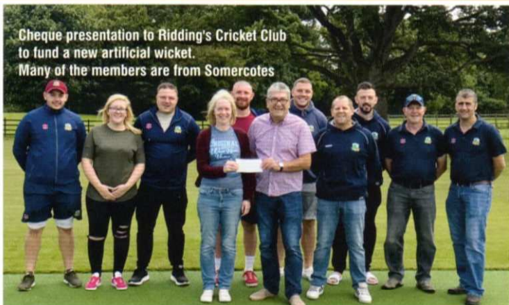
Cheque presentation to Ridding's Cricket Club to fund a new artificial wicket. Many of the members are from Somercotes