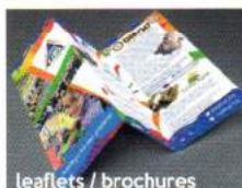
leaflets / brochures