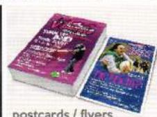
postcards / flyers