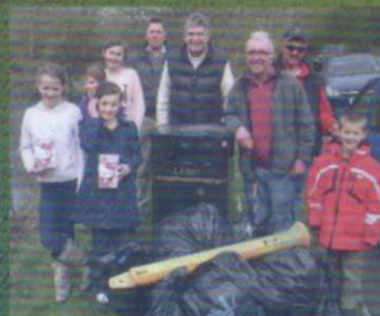
Some of the children collecting rubbish