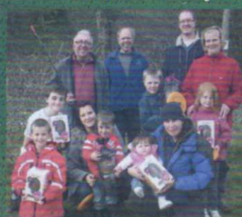
Some of the children taking part in the nature quiz