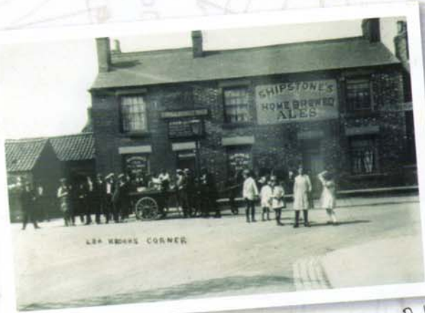
The Three Horse Shoes Pub

Look not a car in sight if you look to the right of the photo is now the site of B&Q.