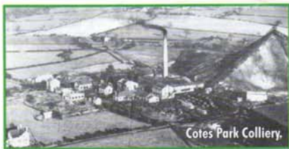
Cotes Park Colliery.