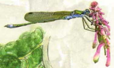
blue tailed damselfly

Pennytown Ponds was once part of a large parkland known as Cotes Park as early as the 14th century. At the beginning of the 19th century the park was sold off into smaller parcels of land. Cotes Park Hall once stood in the centre of the park but this disappeared with the development of the industrial estate. A reminder of its existence is the stone outbuilding at the top of the bridlepath.