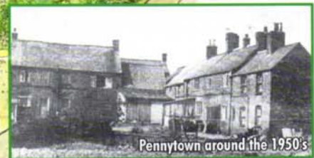
Pennytown around the 1950's

The ponds became isolated and forgotten as the industrial estate was developed during the 1970s, however, the site was designated as a County Wildlife site in the 1980s. Investment in the 1990s and the work of the Pennytown Ponds group and Groundwork has given the area a new lease of life, with the site becoming a Local Nature Reserve in 2002.