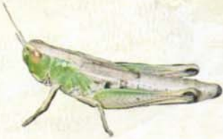
common field grasshopper